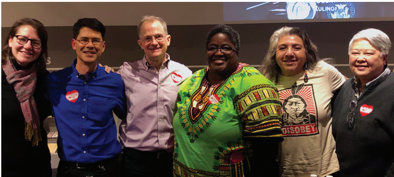
Participants at a February 2019 event at the GLBT Historical Society Museum

We support debate, dialogue and discussion about the LGBTQ past as a way to educate, inspire and empower LGBTQ people and our allies in building our future.