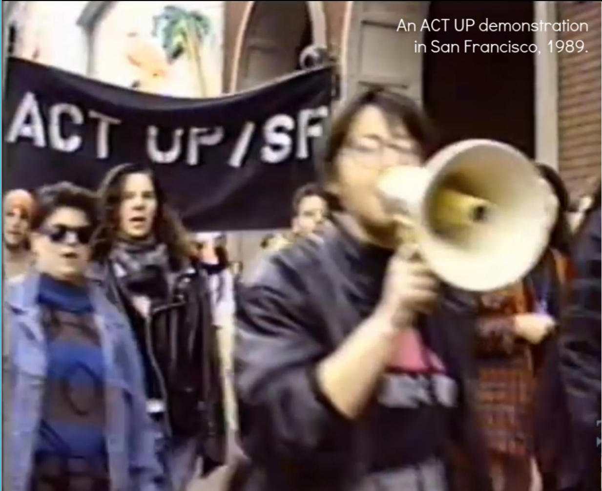
An ACT UP demonstration in San Francisco, 1989.