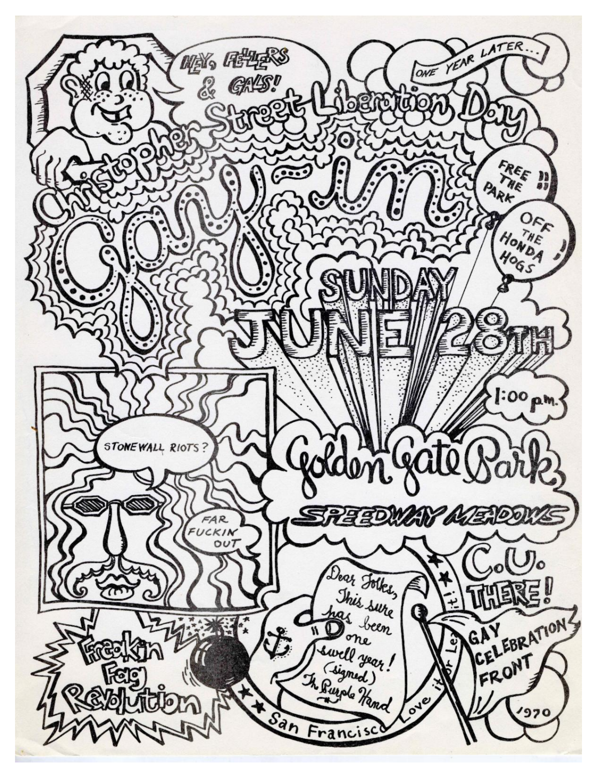
"Christopher Street Liberation Day Gay-In," offset flyer, 1970; Charles Thorpe Papers (1987-02), GLBT Historical Society.

The following graphics may be reproduced free of charge only in conjunction with coverage of the "Labor of Love" exhibition at the GLBT Historical Society Museum. Credits cited in the captions are mandatory. For high-resolution files, contact Mark Sawchuk at mark@glbthistory.org.