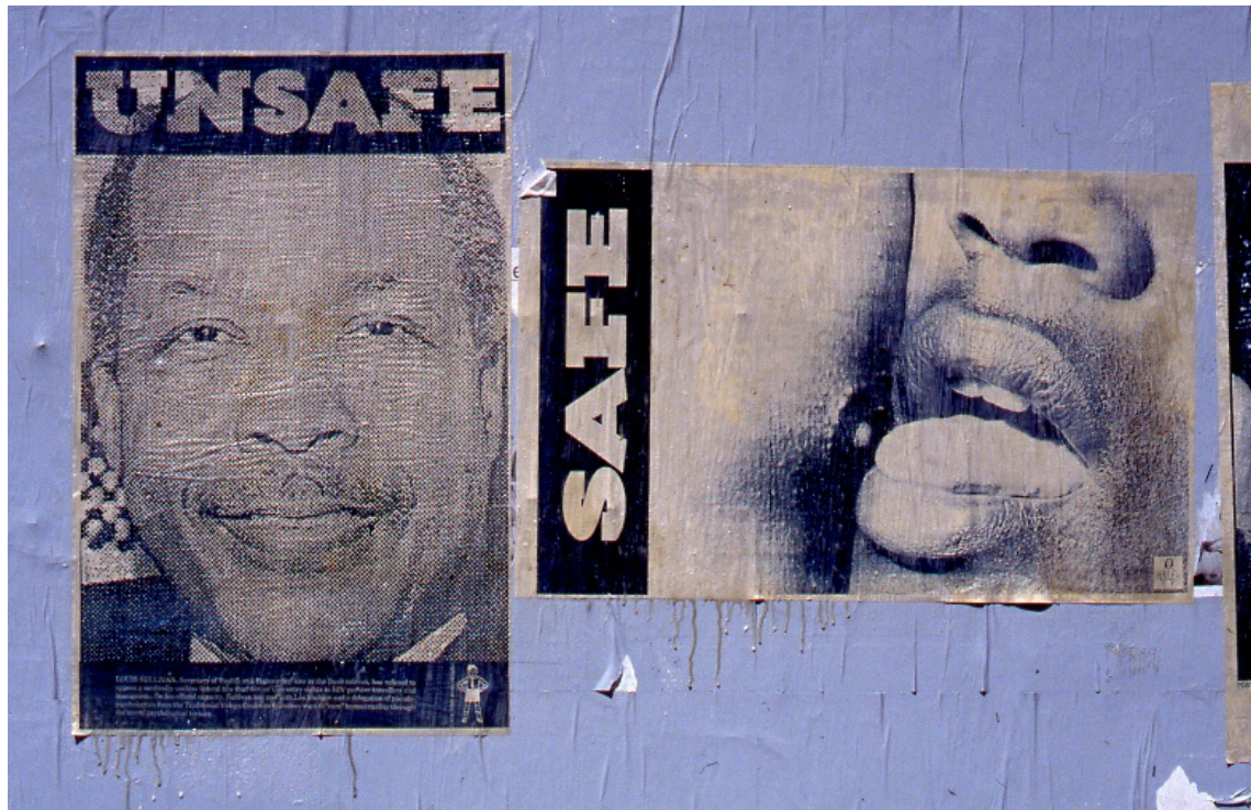
A set of Boy/Girl With Arms Akimbo “SAFE/UNSAFE” posters on a wall in San Francisco in June, 1990