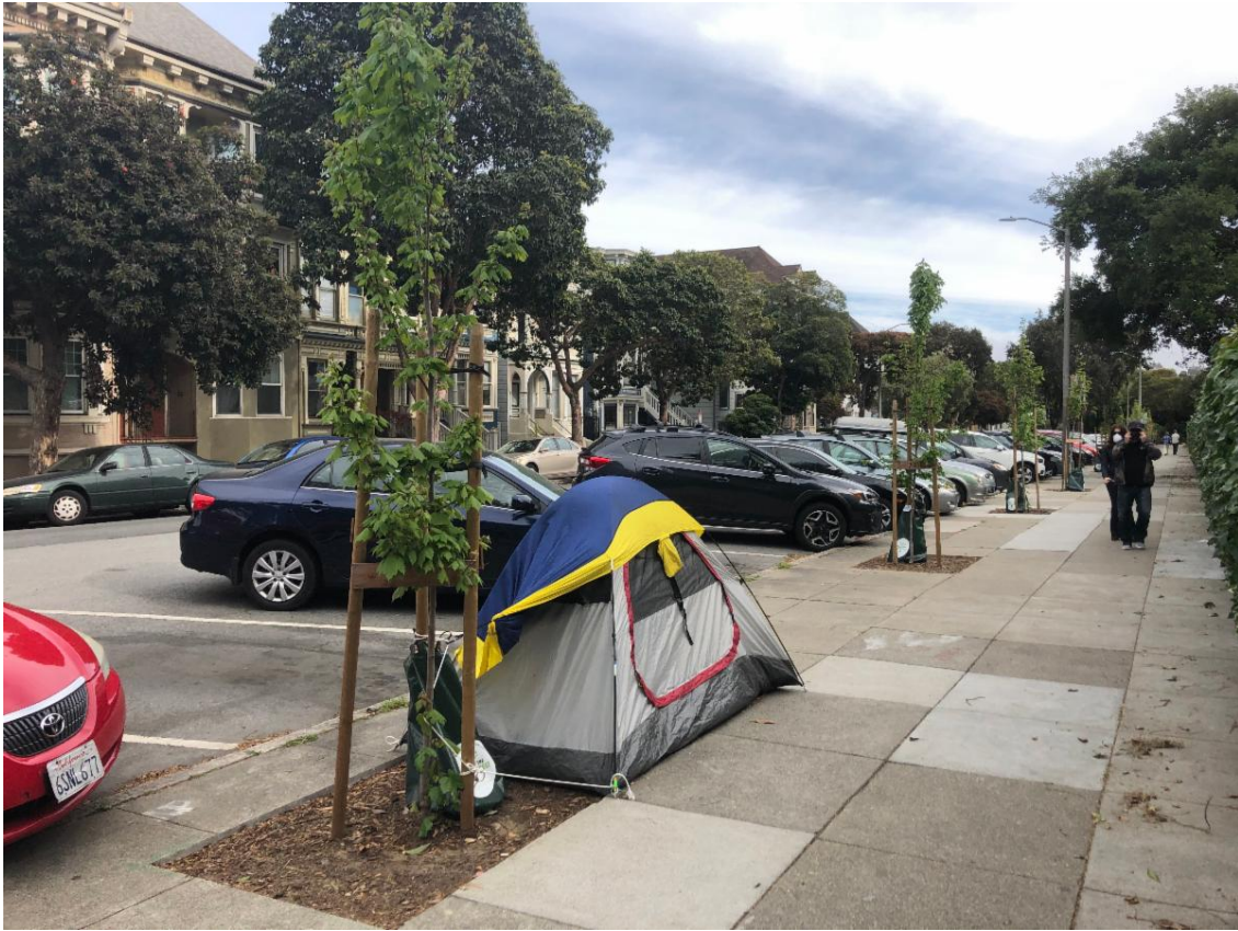
A tent in San Francisco's Duboce Triangle neighborhood