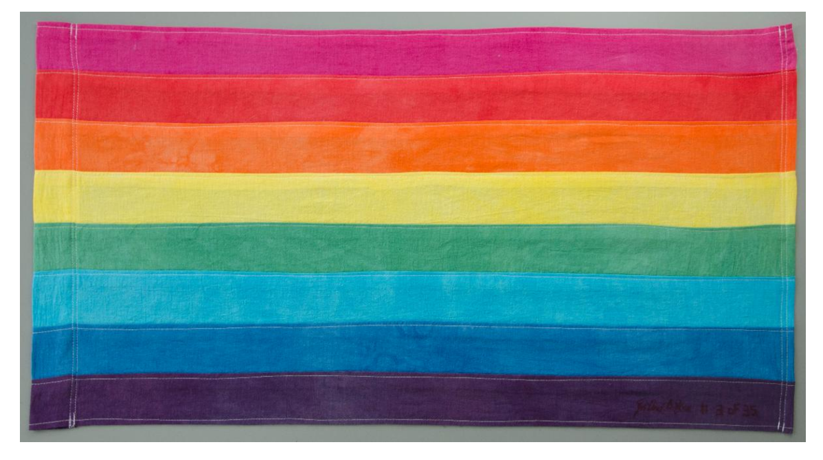
January 2: Workshop

A rainbow flag sewn by Gilbert Baker; photo courtesy of the Gilbert Baker Estate.