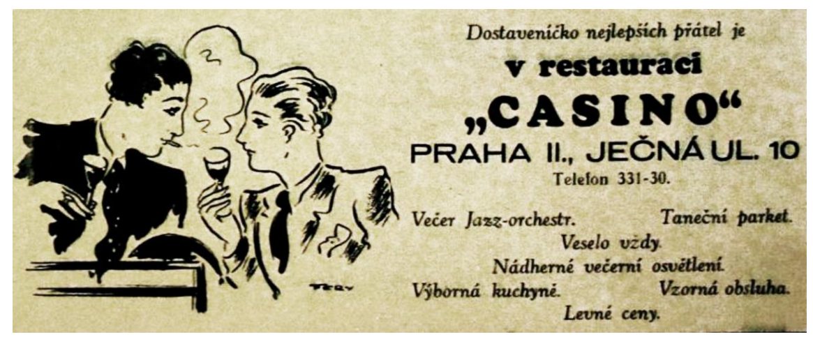
January 23: Illustrated Talk

Advertisement for Casino Restaurant in Prague, an LGBTQ gathering place in the 1930s.