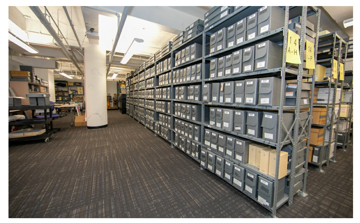
October 13: Community Event

The stacks of the GLBT Historical Society's archives