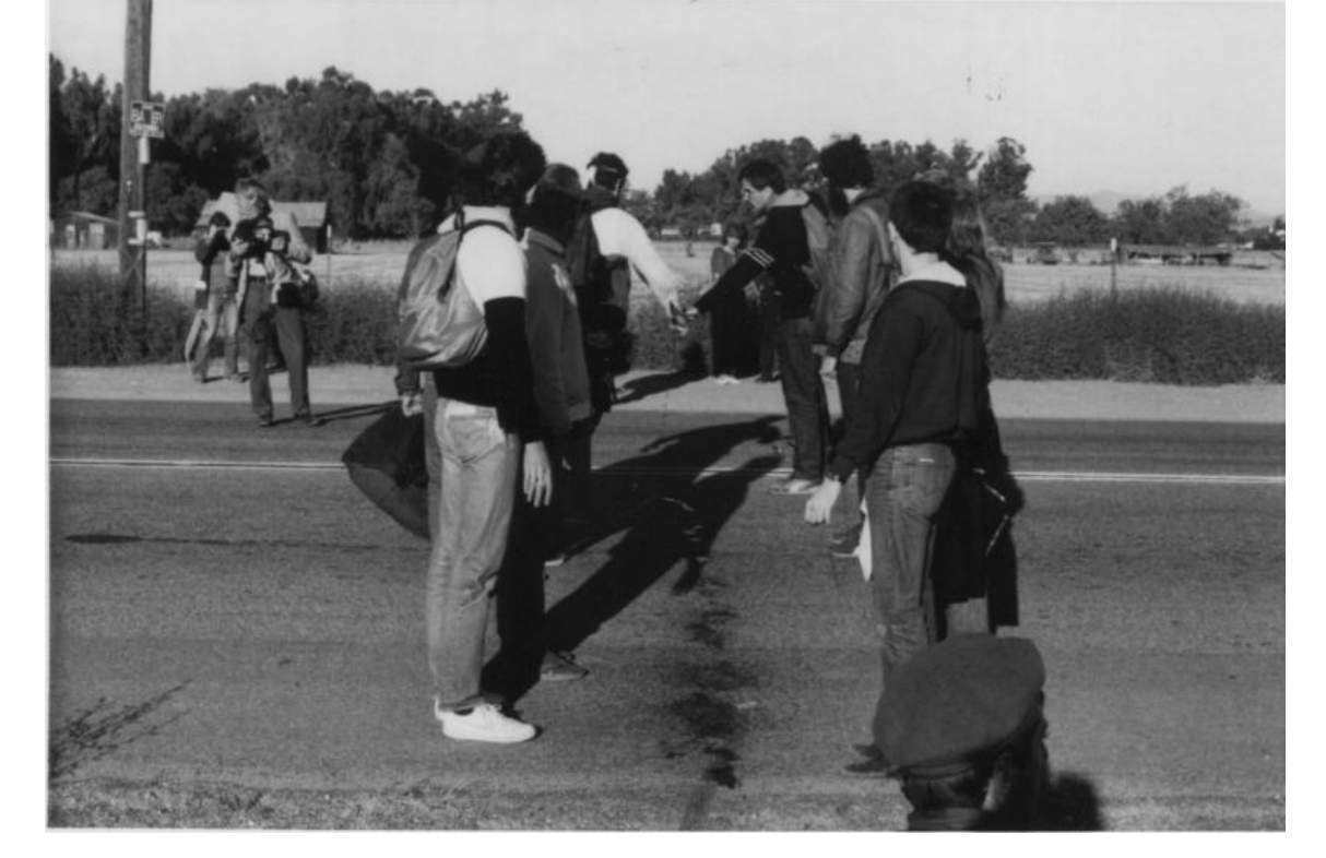
Members of the gay men's affinity and antinuclear group Enola Gay pour blood on the road outside Lawrence Livermore National Laboratory, September 24, 1984