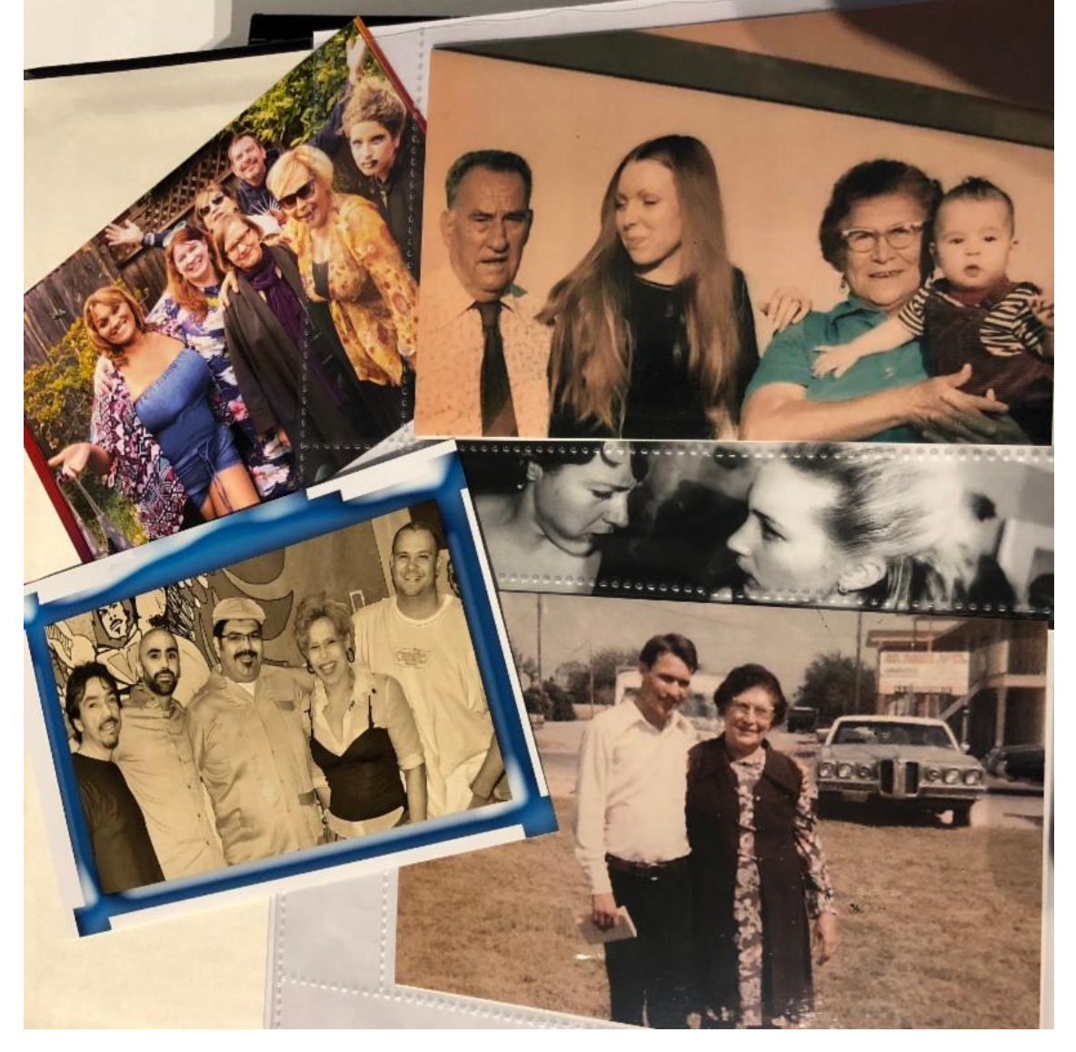
One of the pages in the family albums displayed in the exhibition "Chosen Familias: Bay Area LGBTQ Latinx Stories," now on view at the GLBT Historical Society Museum; photograph by Nalini Elias.